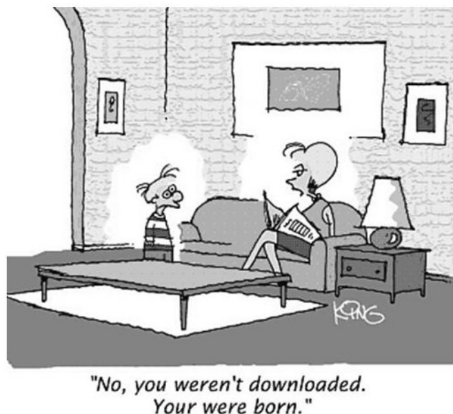
Figure 1.1. A typical figure

Figures and tables captions should be centered if less than one line (Figure 1.1), otherwise justified and indented by 0.8cm on both margins, as shown in Figure 1.2. The font must be Helvetica, 10 point, boldface, with 6 points of space before and after each caption.